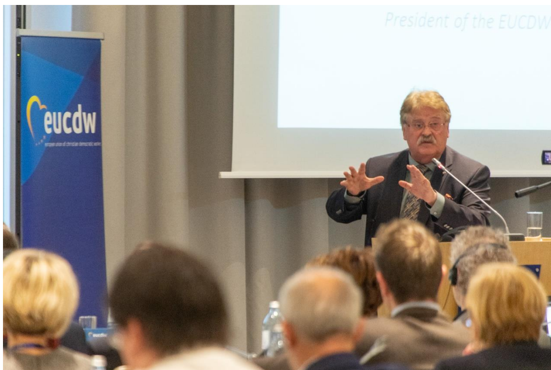
EUCDW President Elmar BROK

The Congress re-elected Elmar BROK as President of the EUCDW with a firm majority and adopted the programme for the 2019 European Elections For a Strong, Just and Ambitious Union: Confidence in Europe's Future . Delegates debated how to deliver a secure, sustainable, prosperous and fair Europe to all the continent's citizens and how to strengthen Europe's social dimension in the face of new cross-border challenges from globalisation and automation to migration and climate change.